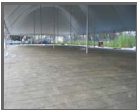
Sub Floor $.80 (sq. ft)