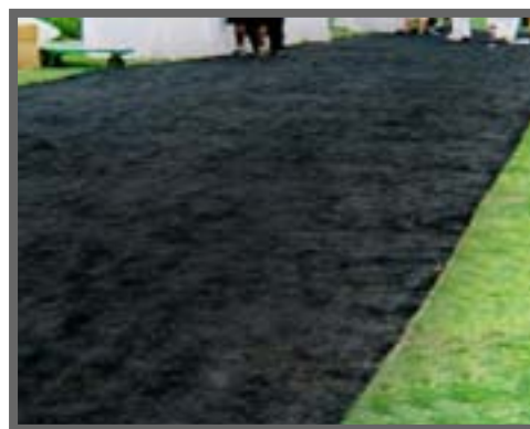
Astro Turf $1.20 (sq.ft)